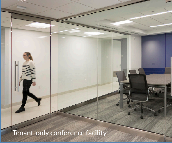
Tenant-only conference facility